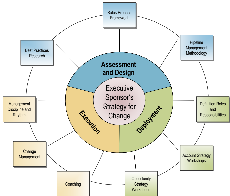
Figure 2. SPO Tool Kit

Best practices research includes a multi-day review of current processes, including methodologies, techniques, competencies, structure, and benchmarks. This effort is supported by interviews with up to twenty key stakeholders (account managers,